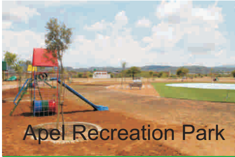
Apel Recreation Park