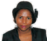
Mammila MW LED