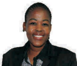
Debeila MB Town Planning