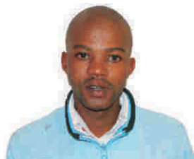
Ngwatle KA Registry