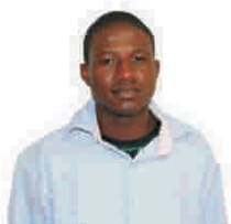
Sebei MN IDP