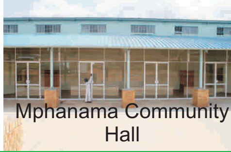
Mphanama Community Hall