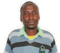
Seema NT Data Capturing