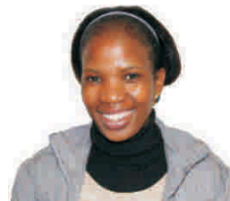
Tjebane MJ Data Capturing